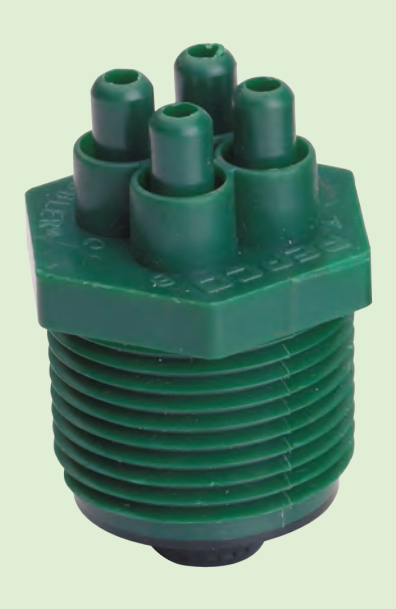
Features & Benefits