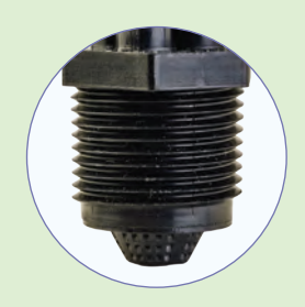
Threaded Inet Connection

Precision moulded liquid silicone rubber diaphragm ensures pressure compensation, uniform water application and long lasting high quality performance