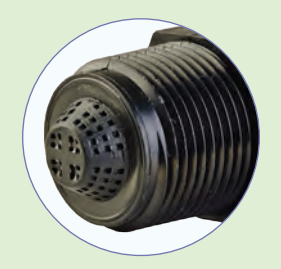
Special Inlet Filter

Four outlet self-cleaning, pressure compensating bubbler