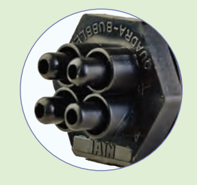
Unique Four Outlet Bubbler

Four outlet self-cleaning, pressure compensating bubbler